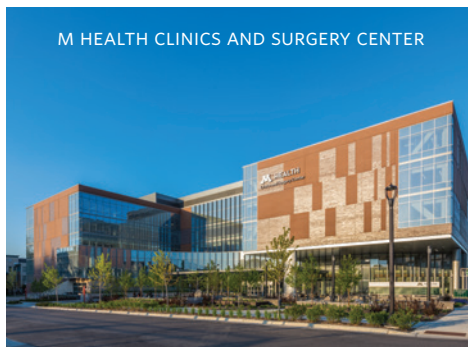
M HEALTH CLINICS AND SURGERY CENTER