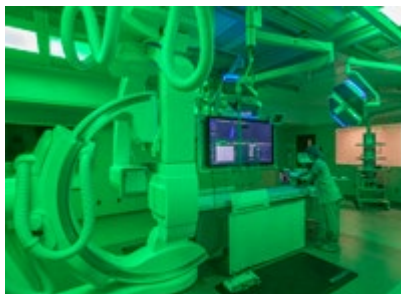
NMED Cardiac Cath Lab