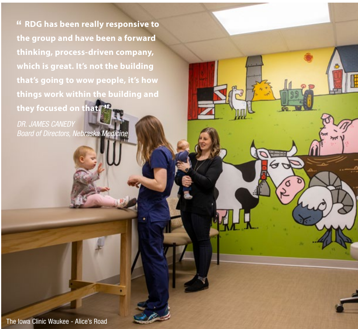
The Iowa Clinic Waukee - Alice's Road