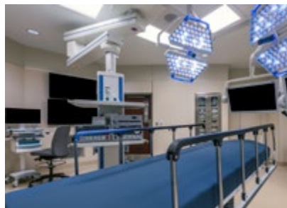
NMED Lauritzen Outpatient Center