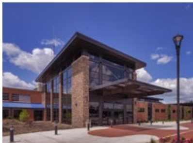
Lakes Regional Healthcare