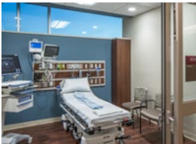
NMED Village Pointe ASC

Our healthcare team listens to you, creating solutions that enhance patient experience by considering the whole patient—beyond diagnosis.