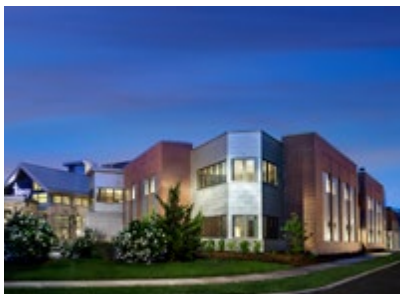
MercyOne North IA Behavioral Health