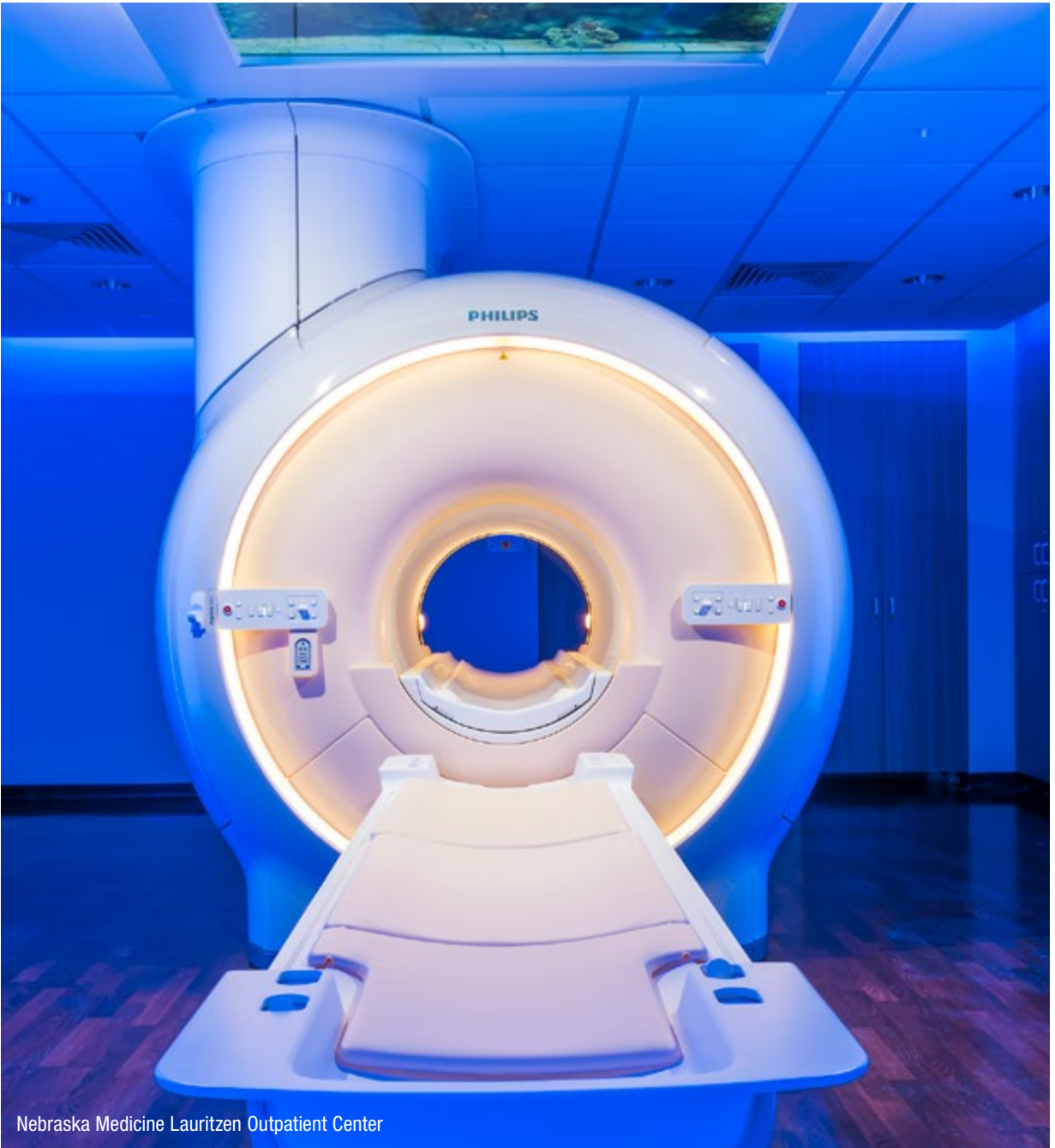
Nebraska Medicine Lauritzen Outpatient Center