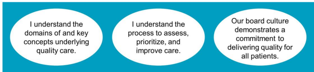
Figure 1. Vision of Effective Board Governance of Health System Quality

IHI worked with the expert group to establish an aspirational vision for trustees: With the ideal education in and knowledge of quality concepts, every trustee will be able to respond to three statements in the affirmative (see Figure 1).