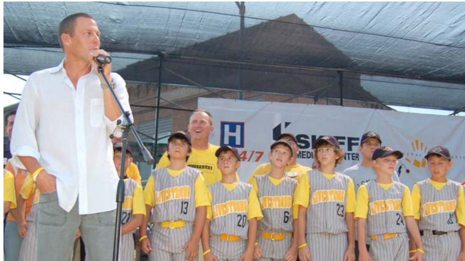
Speaking from the stage sponsored by IHA and Skiff Medical Center, world-champion cyclist Lance Armstrong addresses 30,000 people in Newton.

IHA announced this week it will donate $2,000 to the Lance Armstrong Foundation. The donated money was raised through the sale of special yellow T-shirts created by IHA and sold at IHA's booth during this week's RAGBRAI.