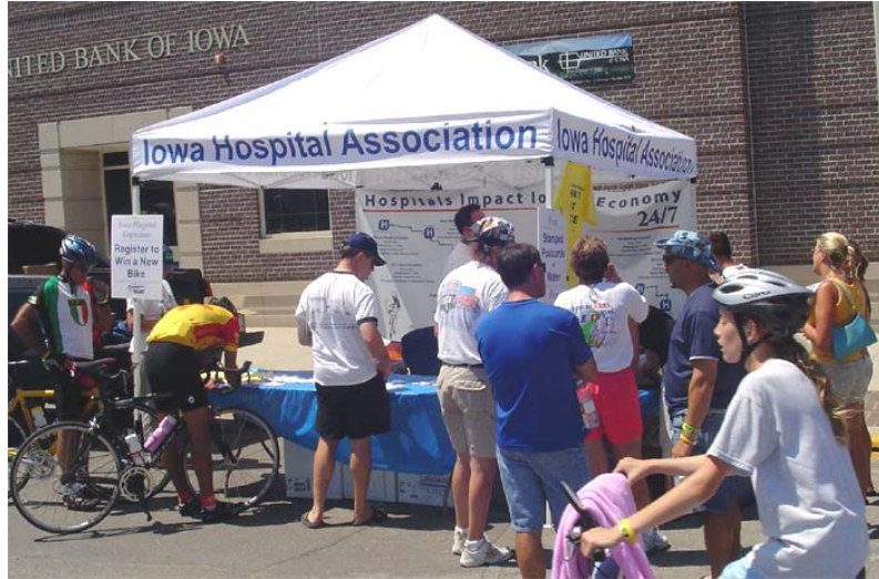
RAGBRAI participants pick up maps, postcards, and bottled water at IHA's booth in Ida Grove.

In addition to the many give-away items, the IHA booth featured a large banner showing the economic impact of each hospital along the RAGBRAI route, which began in Sergeant Bluff, stopped overnight in Ida Grove, Audubon, Waukee, Newton, Marengo, and Coralville, and finishes in Muscatine. In addition, press releases were prepared and delivered to media outlets in each community.